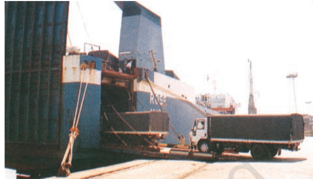
Fig. 7.6: Trucks being driven into the vessel at Mumbai port

Deendayal Port, is a tidal port. It caters to the convenient handling of exports and imports of highly productive granary and industrial belt stretching across UT of Jammu and Kashmir, and the states of Himachal Pradesh, Punjab, Haryana, Rajasthan and Gujarat.