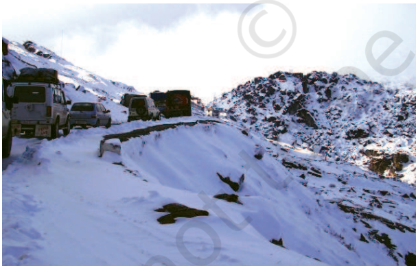
Fig. 7.4: Traffic on north-eastern border road (Arunachal Pradesh)

Roads can also be classified on the basis of the type of material used for their construction such as metalled and unmetalled roads. Metalled roads may be made of cement, concrete or even bitumen of coal, therefore,