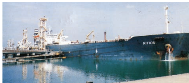
Fig. 7.7: Tanker discharging crude oil at New Mangalore port

Mumbai is the biggest port with a spacious natural and well-sheltered harbour. The Jawaharlal Nehru port was planned with a view to decongest the Mumbai port and serve as a hub port for this region. Marmagao port (Goa) is the premier iron ore exporting port of the country. This port accounts for about fifty per cent of India's iron ore export. New Mangalore port, located in Karnataka caters to the export of iron ore concentrates from Kudremukh mines. Kochchi is the extreme south-western port, located at the entrance of a lagoon with a natural harbour.