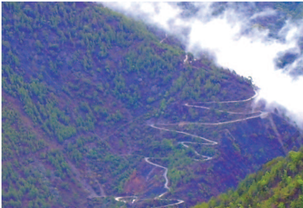
Fig. 7.3: Hilly Tracts