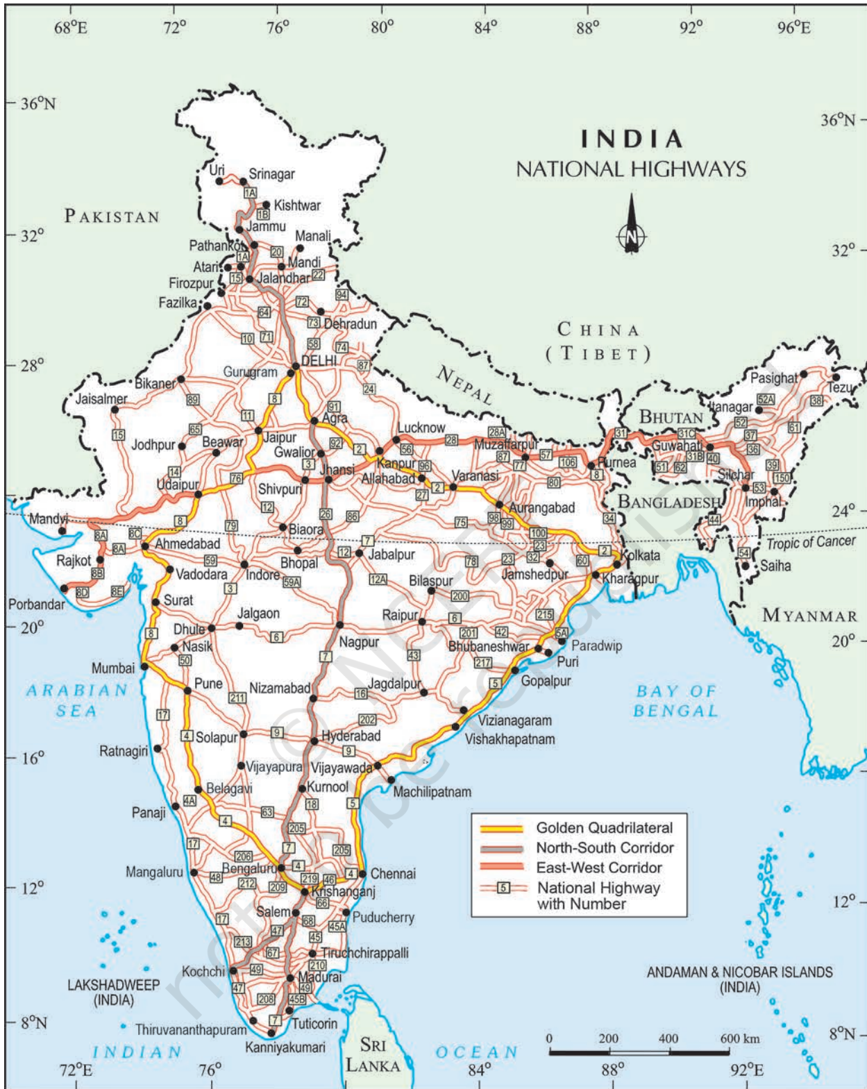
India: National Highways