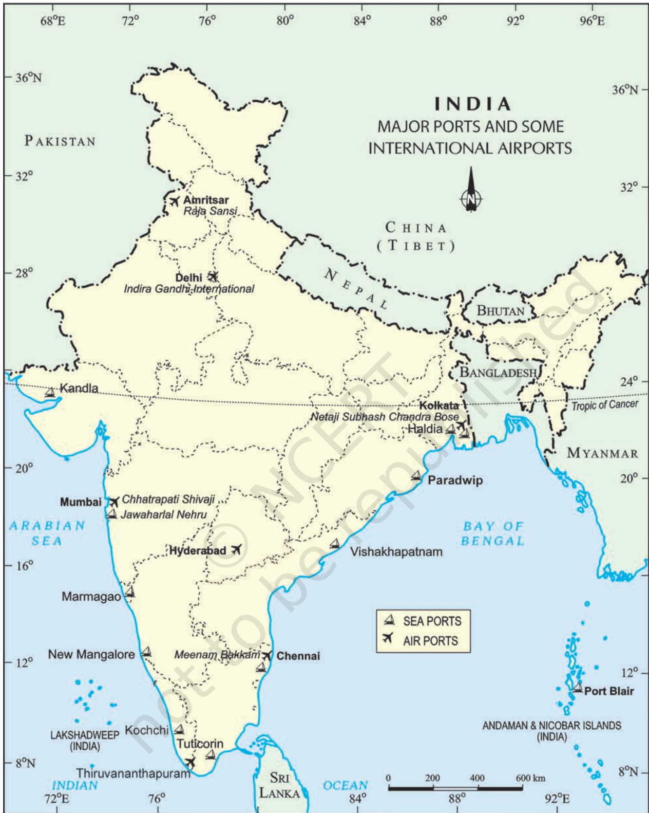
India: Major Ports and Some International Airports