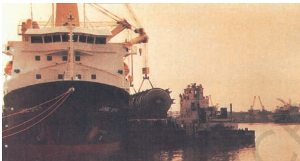
Fig. 7.8: Handling of oversize cargo at Tuticorin port

even our neighbouring countries like Sri Lanka, Maldives, etc. and the coastal regions of India. Chennai is one of the oldest artificial ports of the country. It is ranked next to Mumbai in terms of the volume of trade and cargo. Vishakhapatnam is the deepest landlocked and well-protected port. This port was, originally, conceived as an outlet for iron ore exports. Paradwip port located in Odisha, specialises in the export of iron ore. Kolkata is an inland riverine port. This port serves a very large and rich hinterland of Ganga-Brahmaputra basin. Being a tidal port, it requires constant dredging of Hoogly. Haldia port was developed as a subsidiary port, in order to relieve growing pressure on the Kolkata port.