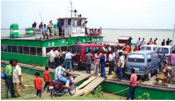
Fig. 7.5: Inland waterways widely used in north-eastern states