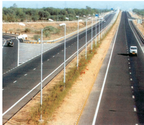
Fig. 7.2: Ahmedabad- Vadodara Expressway